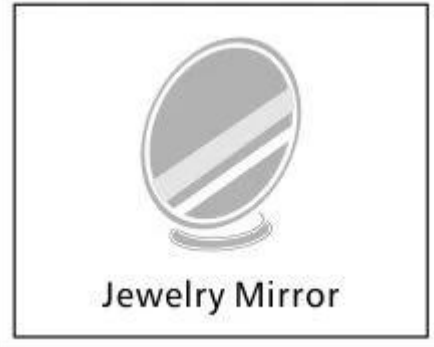
Environment \\ \\ \\ \\ \\ \\