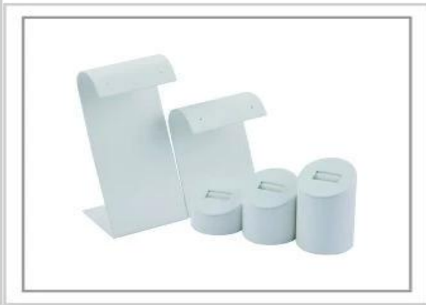
The jewelry display stand