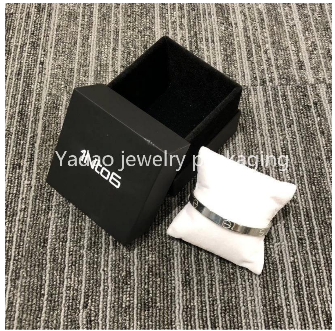
Other products that may interest you: