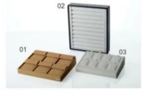
01 YDESP05 165*110*25/45mm 02 YDESP06 165*110*25/45mm 03 YDJZP07 200*235*40mm