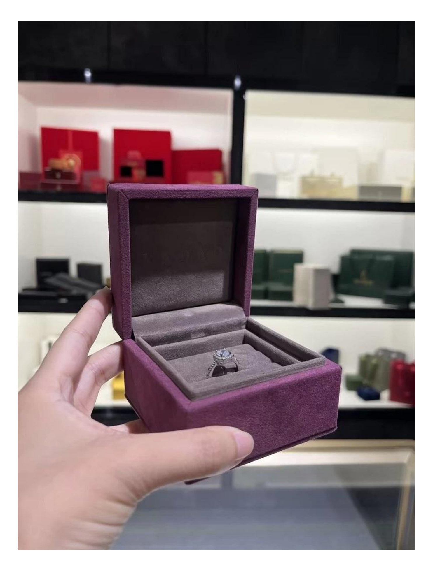
Other products that may interest you: