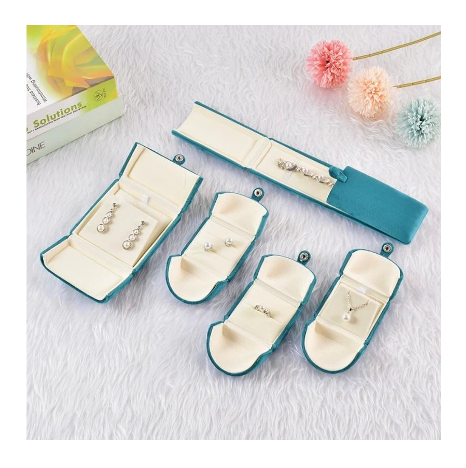
☐ Yadao's office ☐