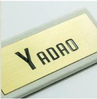
metal logo plate