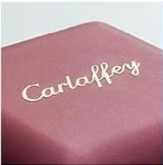
metal logo sticker