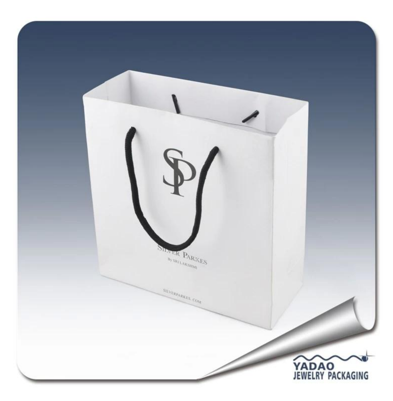
Other products you may interested in: