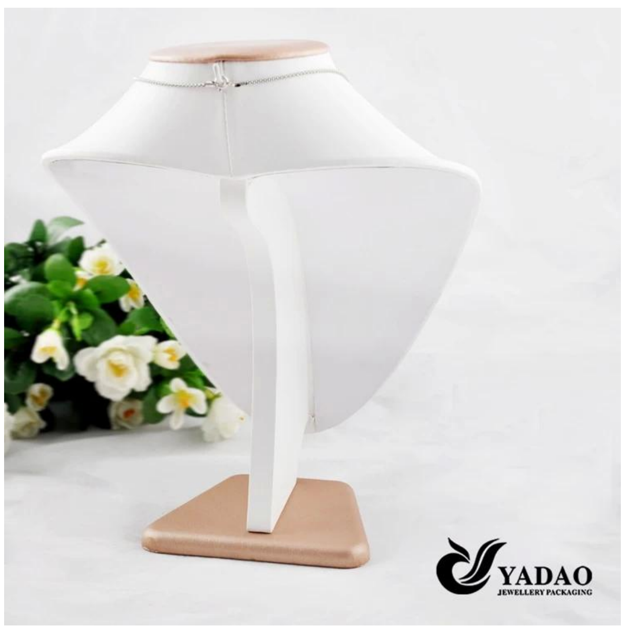
Other products you may interested in: