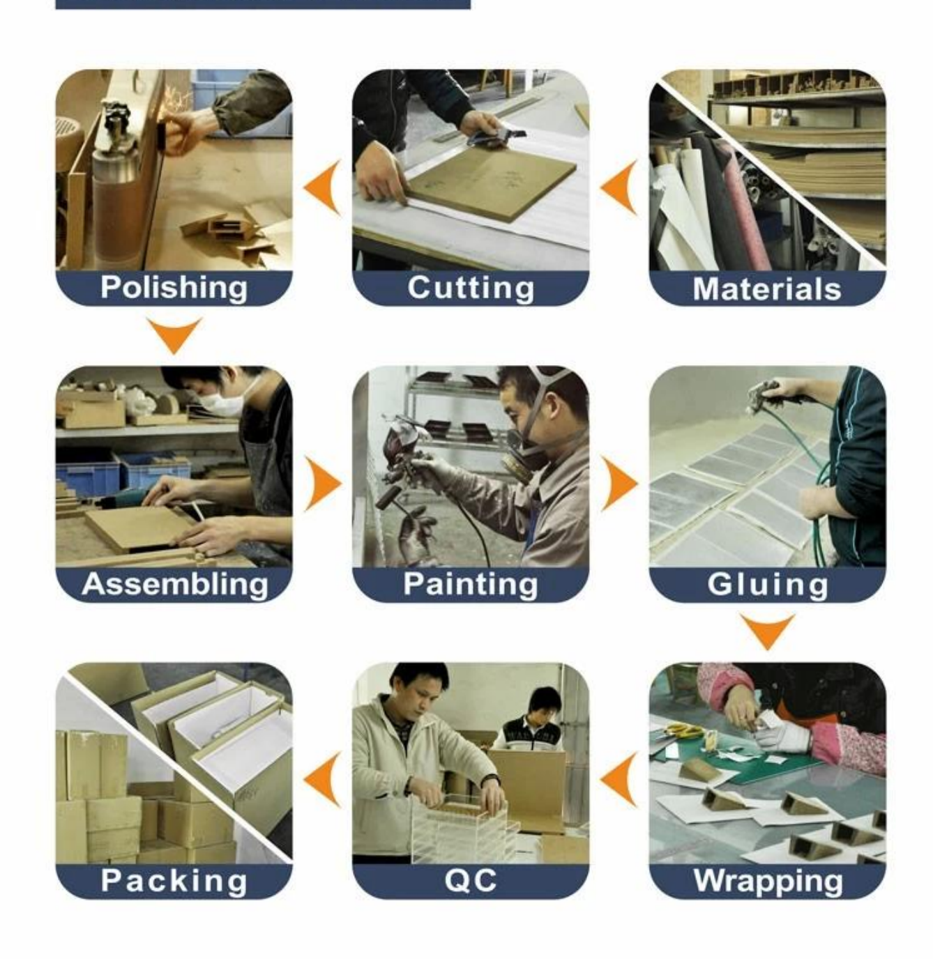
Packaging & Delivery