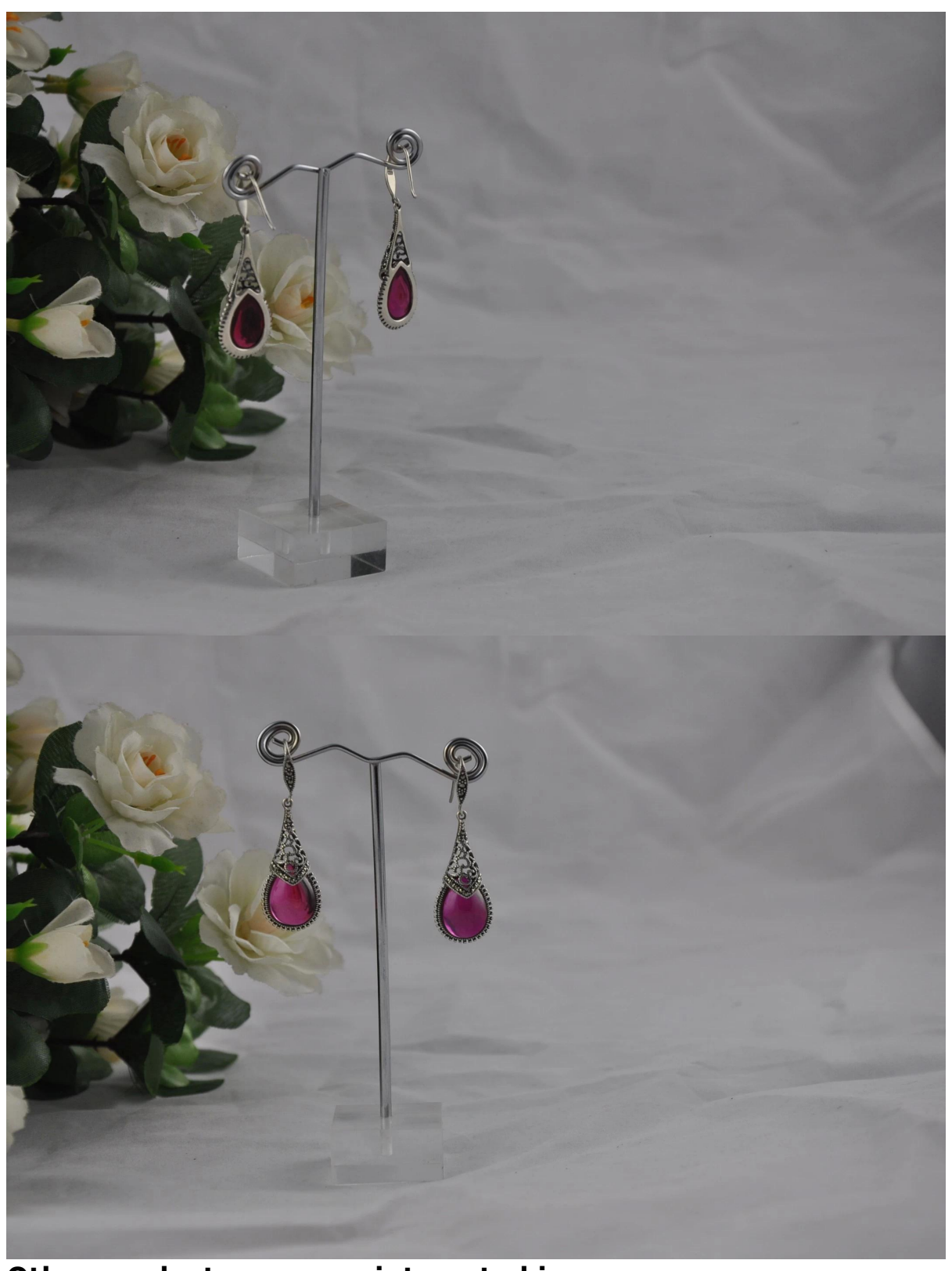
Other products you may interested in: