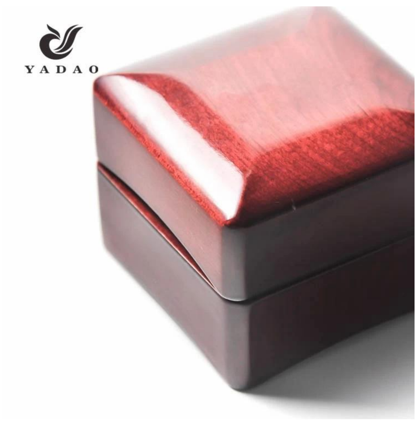
Other products you may interested in: