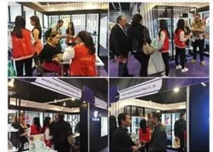
2018 Hongkong international jewellery show