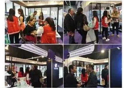
2018 Hongkong international jewellery show