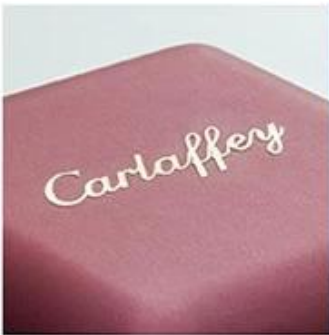
metal logo sticker