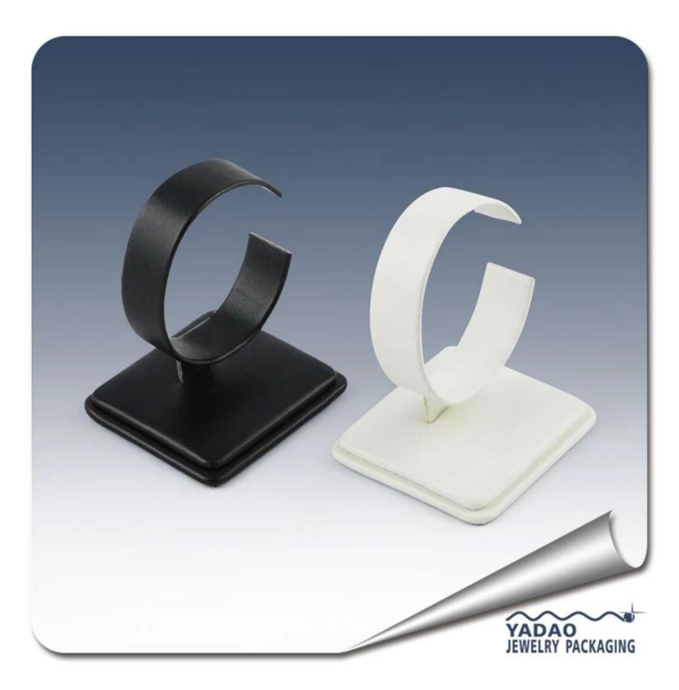
Other products you may interested in: