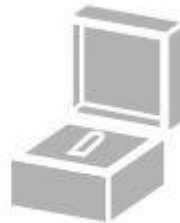
Jewelry Display Stands