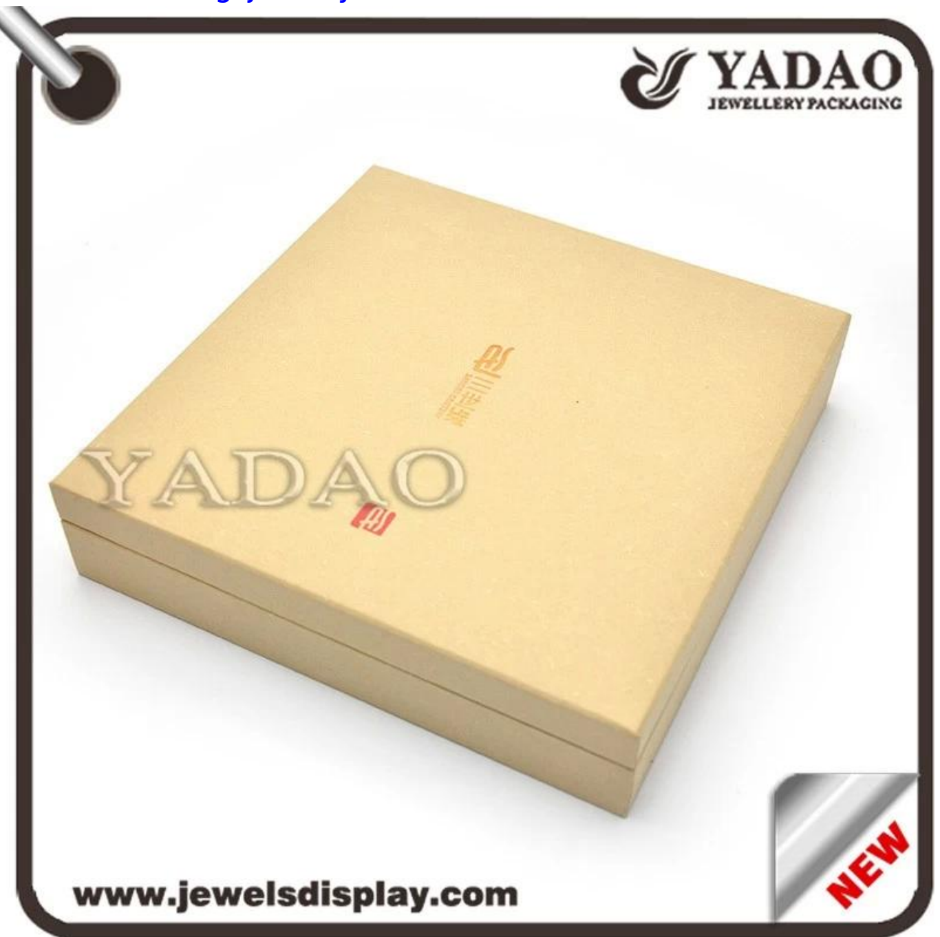
Big jewelry set box wood customize