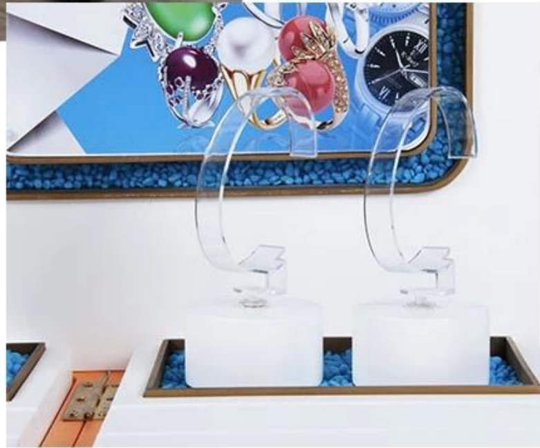
wooden watch stand with clear C ring