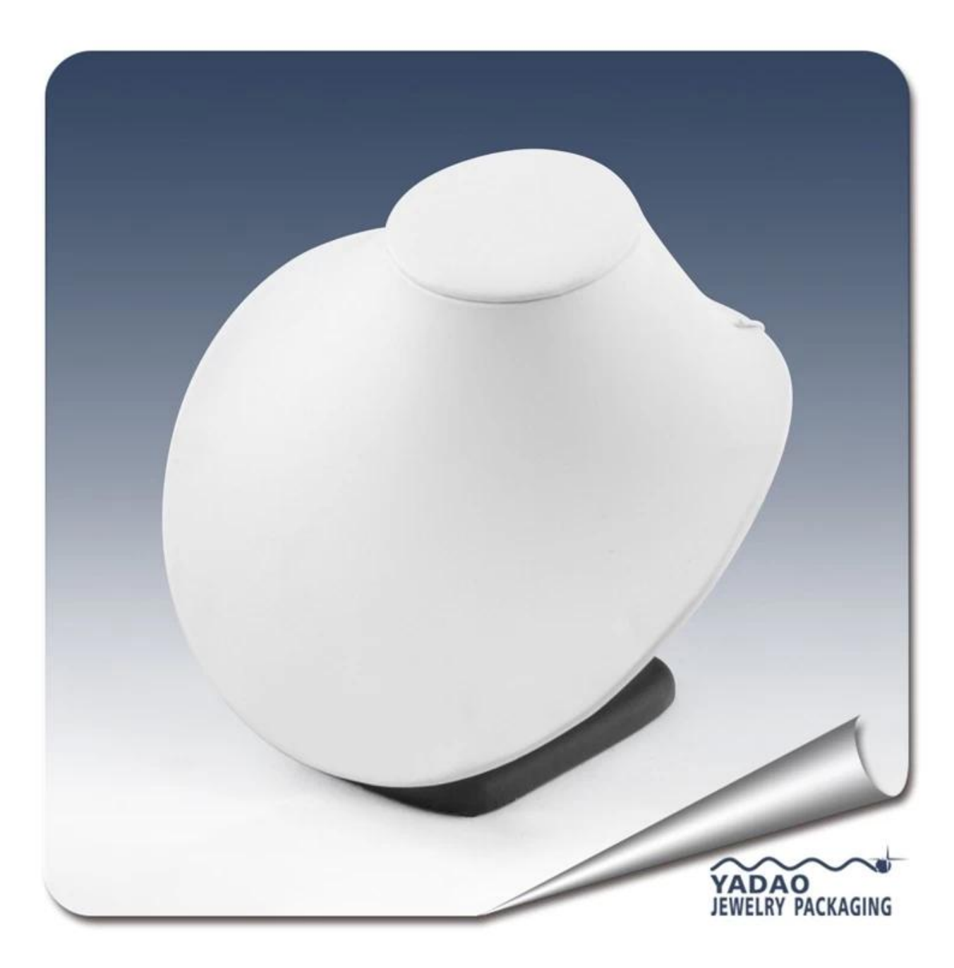
Other products you may interested in: