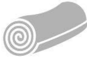
Jewelry Roll bag