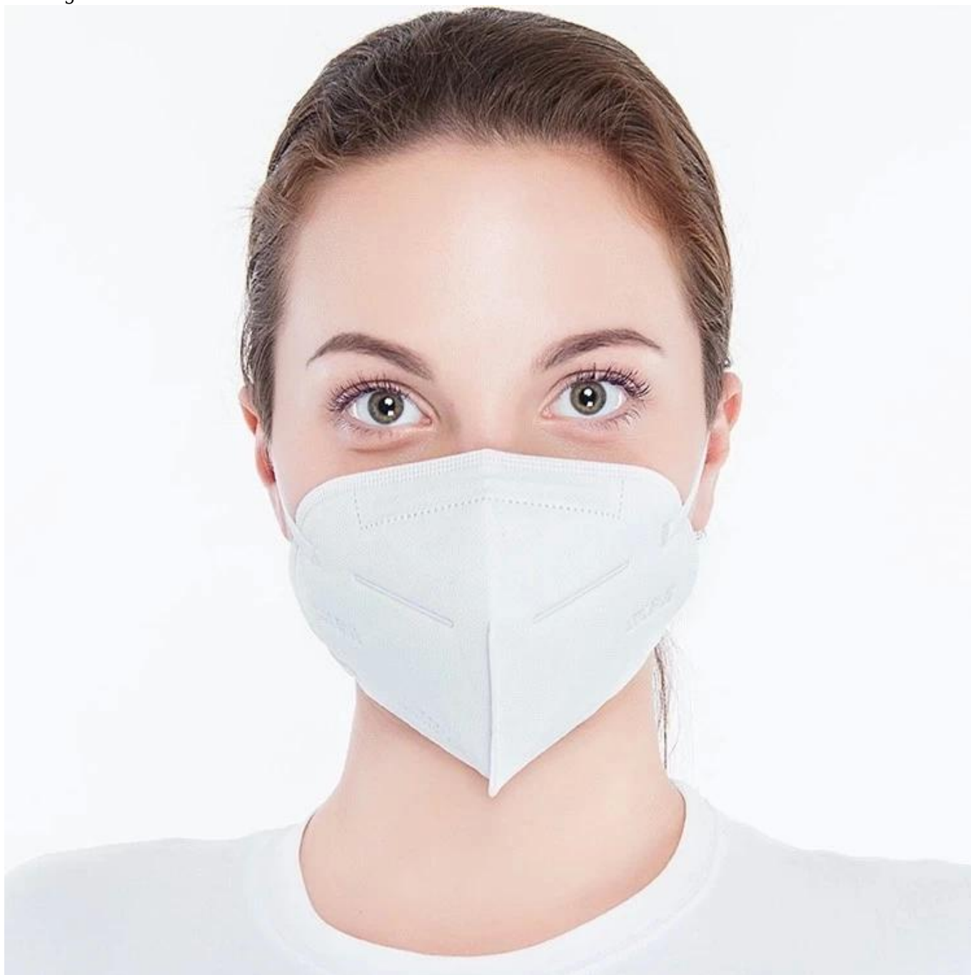
Einweg-Vlies-Coronavirus KN95 Falthalbmaske für Corona-Virus