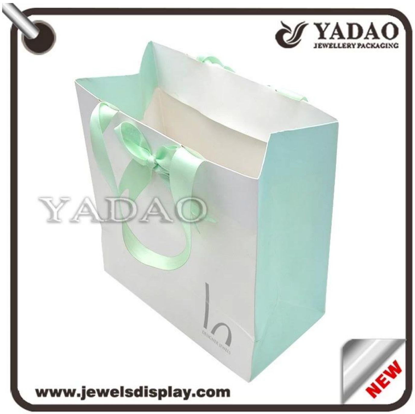
Other products you may interested in: