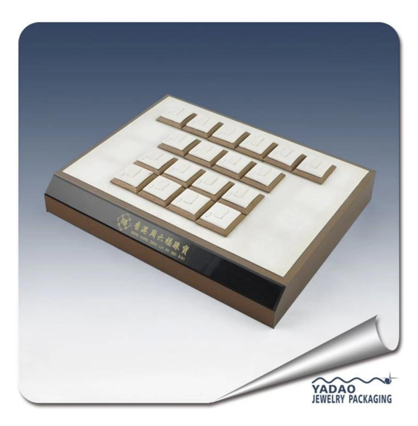
Other products you may interested in: