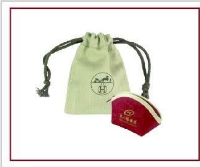
المجوهرات الاعلانية والتظاهر