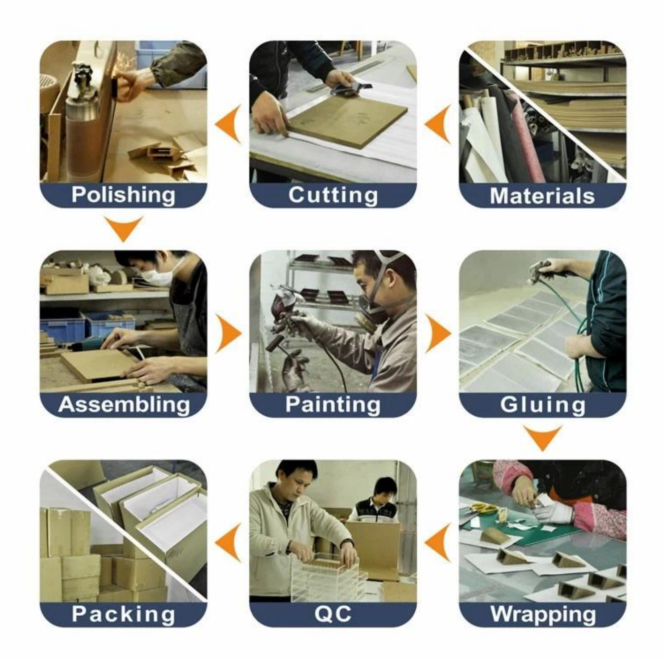
Packaging & Delivery □