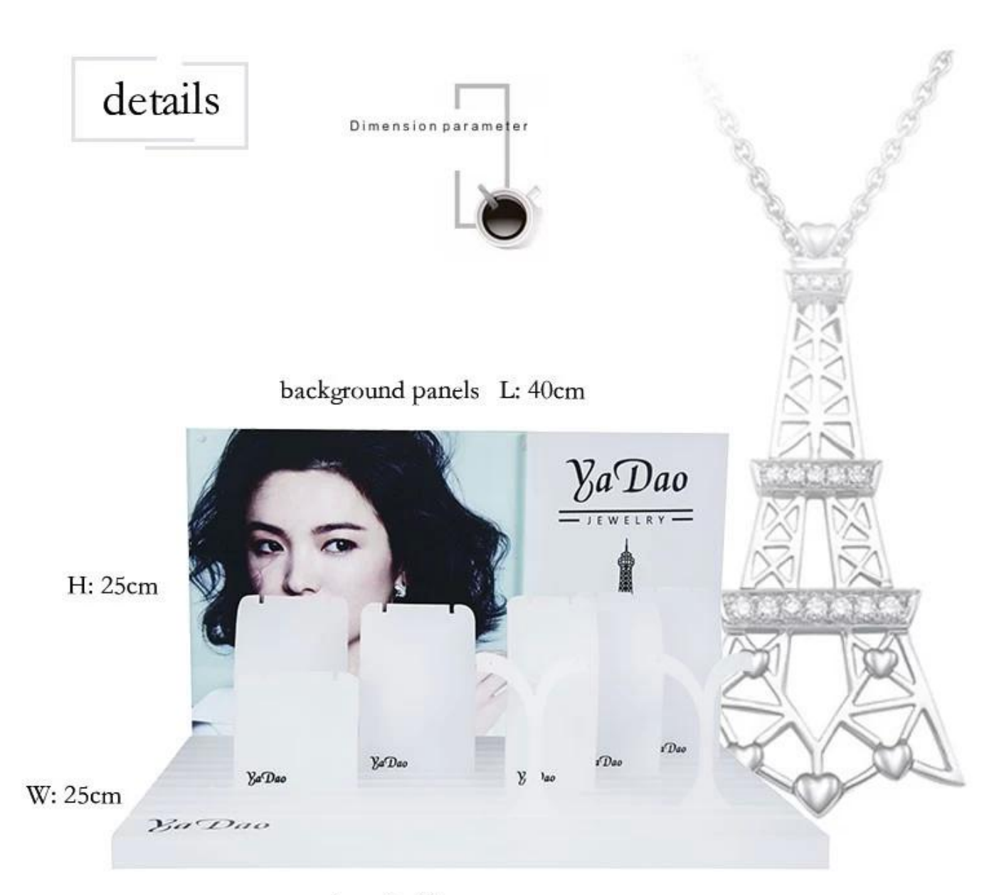
base L: 40cm