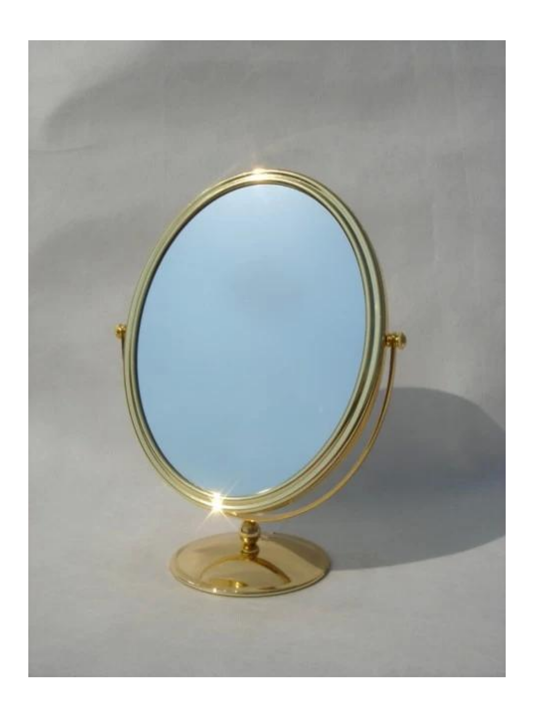
Other products you may interested in: