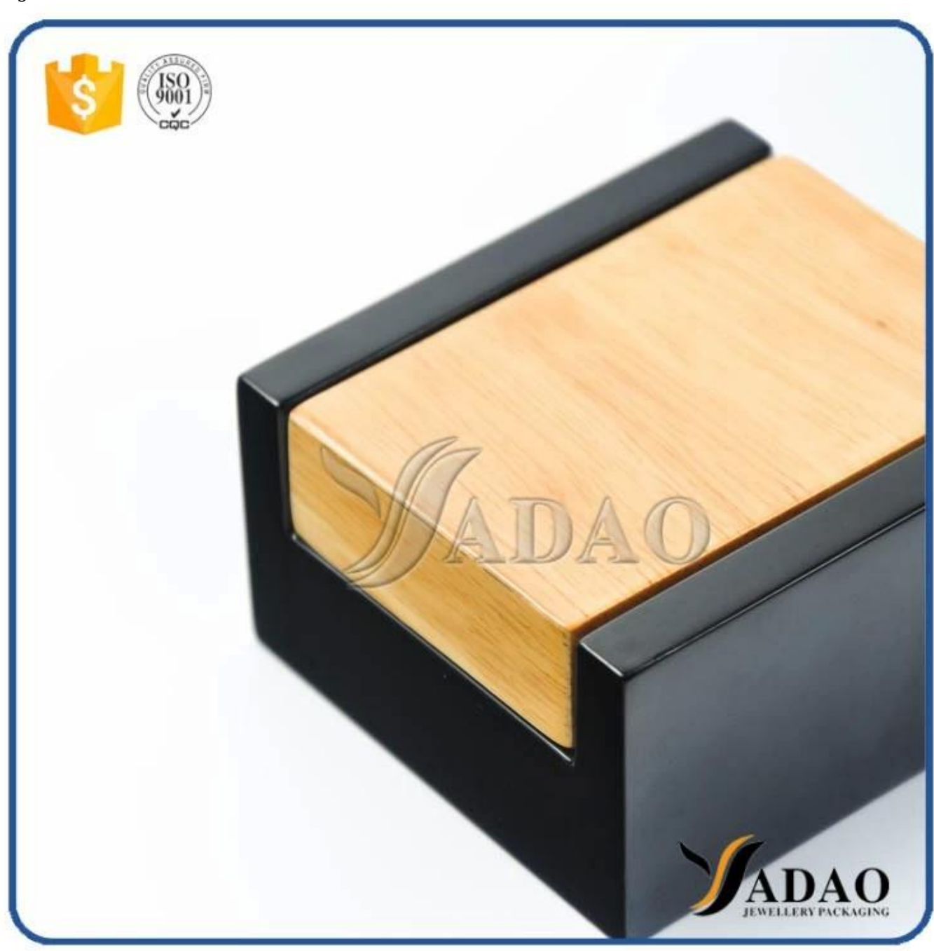
Used for ring or earring or pendant