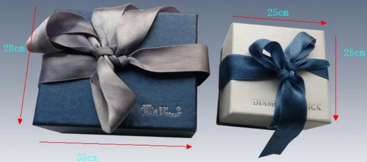
Paper Jewelry Boxes for Ring & Pendent

Size: 25*25 cm or customized Color: blue or customized MOQ: 3000 pcs Used: for the jewelry boxes and gift boxes for ring/pendant