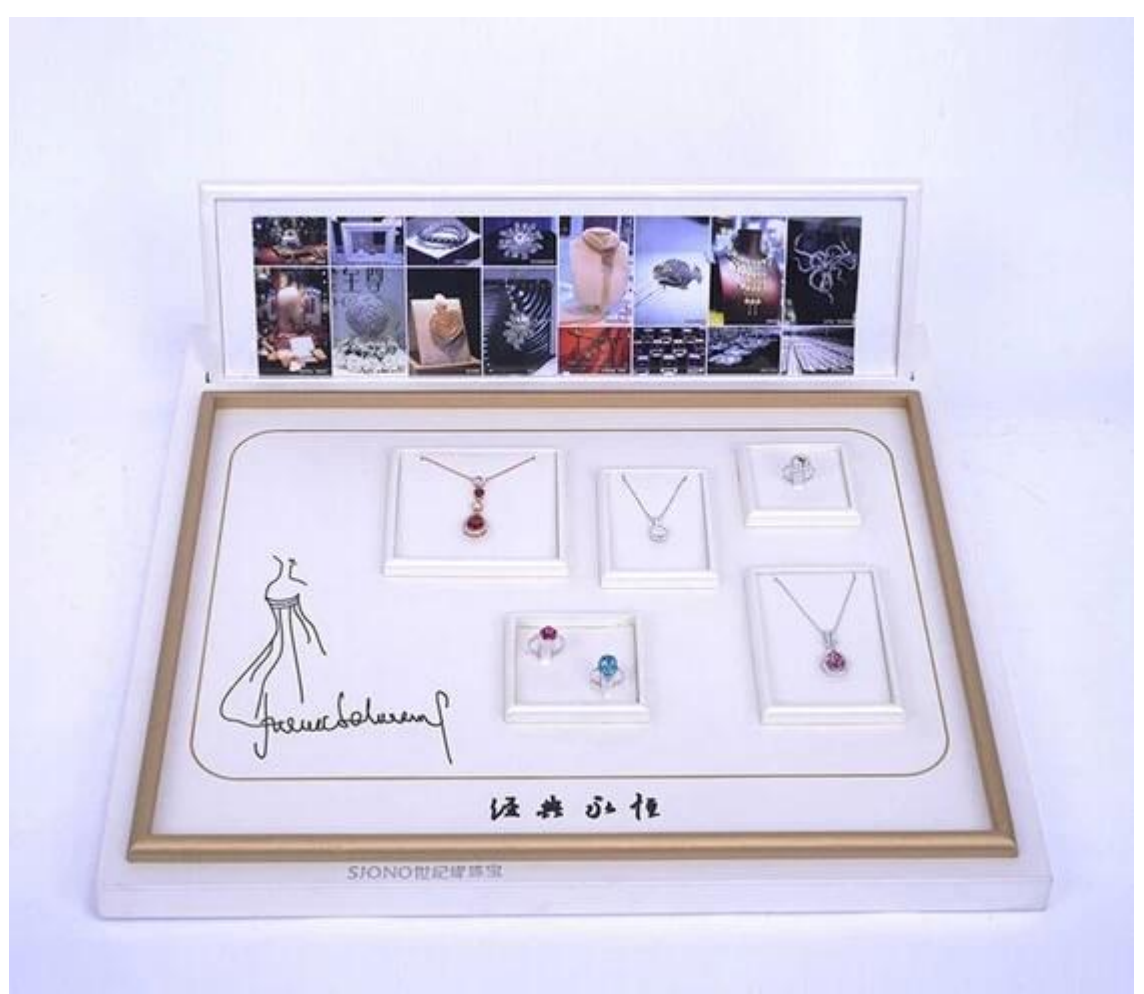
Other products you may interested in: