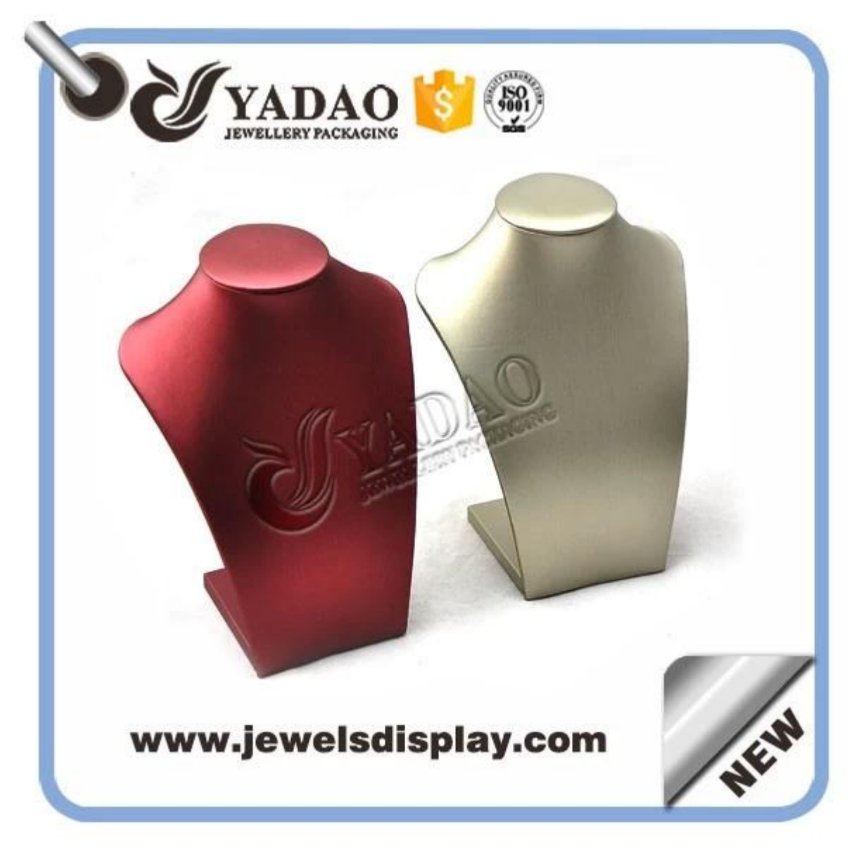
table standing wooden necklace bust display jewelry necklace pendant stand pu leather cover wooden necklace bust stand