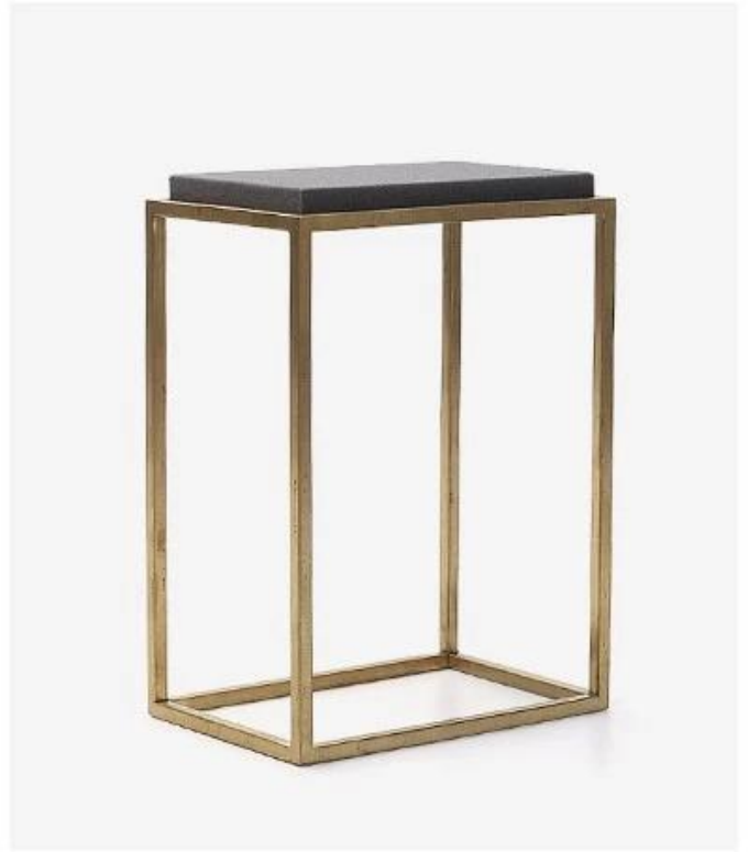
12*8*17cm (L*W*H) 375g

Also, safe packing to ensure the perfect arrival.