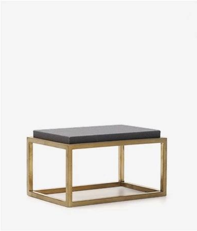
12*8*7cm (L*W*H) 295g