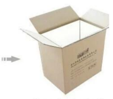
Carton with foam Inside